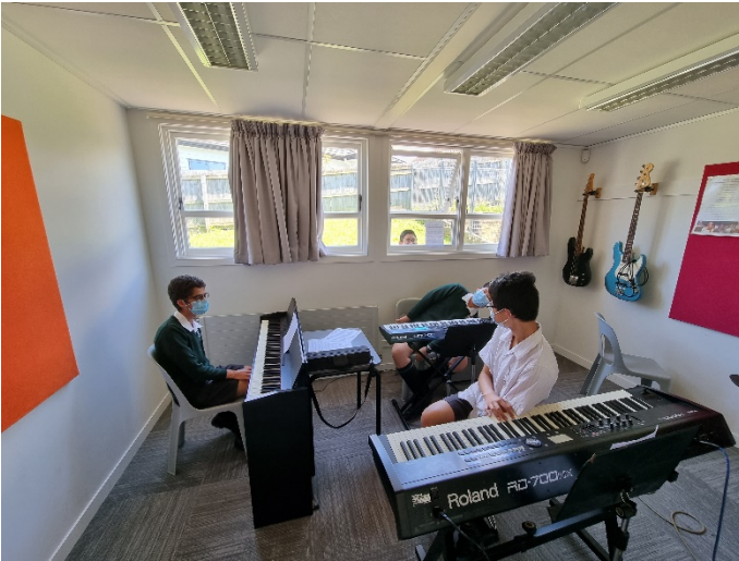
Year 10 Music social distancing with a student playing the flute outside through the window, for safety.

Art Students in art have been awesome since they returned to learning at school. They are keen to learn and have been very productive in class. It has been fun having students back on site again.